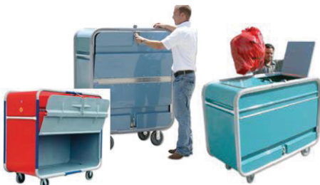
Upper & Lower Doors TQ-400 & TQ 488