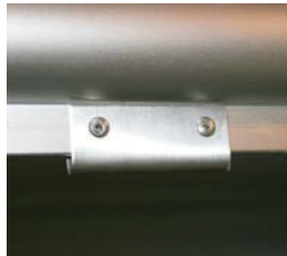
Strike Plate - For Refrigerator Latch