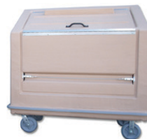
TQ-236 & TQ-227 Doors