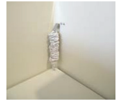
Basket Platform Lift Spring