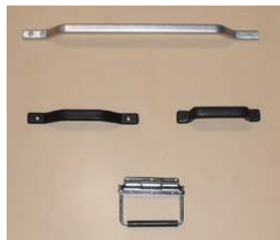
Variety of Push Handles