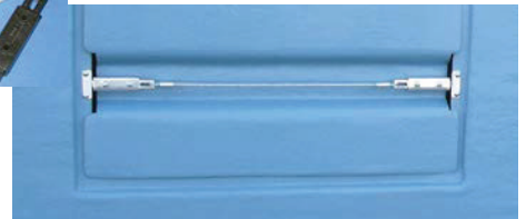
Front Door Slam Latch - 2 Latches with Cord