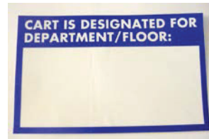
ID Labels Peel & Stick