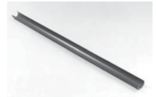
Snap on Bumpers (Set of 4) Plastic Exterior Bumpers