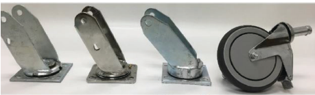
5", 6" & 8" Wheels & Casters Variety of Treads - we will look at your order to help with the correct tread