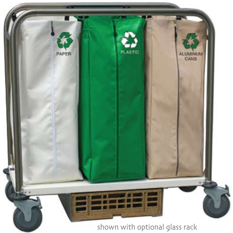
shown with optional glass rack