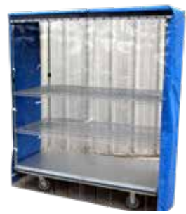
2 Way Entrance Covers (Transparent or Vinyl)