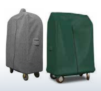
LUGGAGE CART COVERS Any style or size

Measurement Forms are located on pages 7-12 to assist you, or call the TQ COVER CREW for assistance.