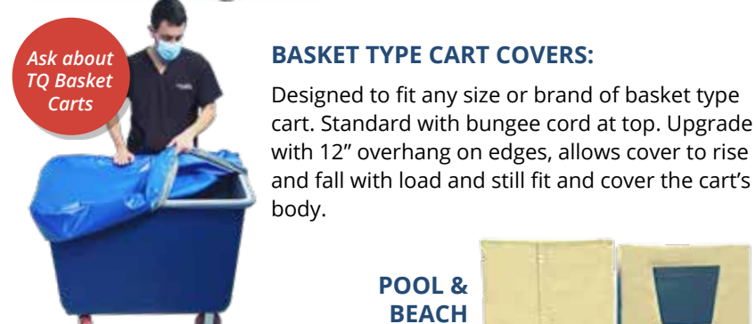
POOL & BEACH

Your choice of either Full Drape Style or Cut-out Cap Style. Both will cover cart and protect linens or supplies.