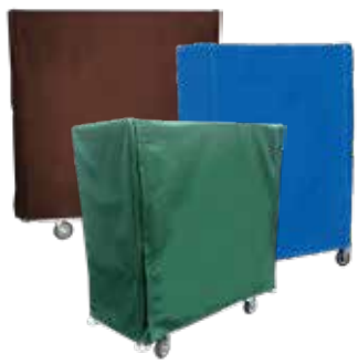
Drape Covers Variety of Colors