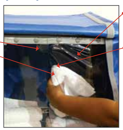
Zipper or Velcro Closures