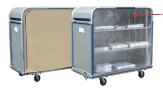
Optional Double Cover System

Combines Pass-Thru with Solid Front Vinyl Cover to Seal Load during transport. See page 4 for details.