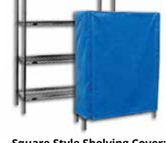
Square Style Shelving Cover: Ideal for all types of shelving