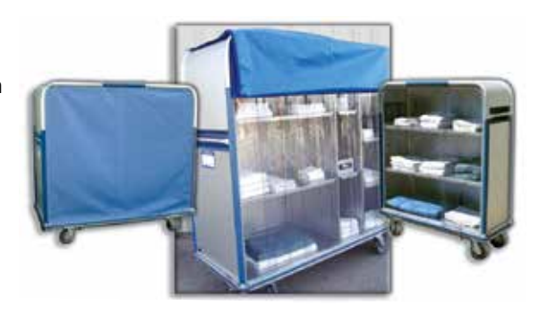
Zipper or Velcro Closures