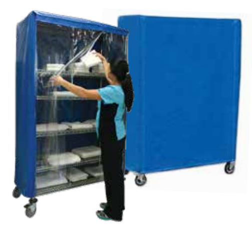
Left: Pass-Thru on Drape Cover

Right: All Drape Style Pass-Thru Covers are also equipped with a solid front vinyl cover to seal load in transport.