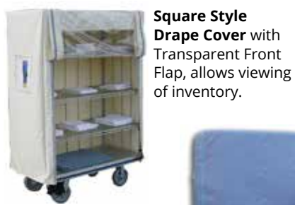
Round Style Drape Cover, fits beautifully