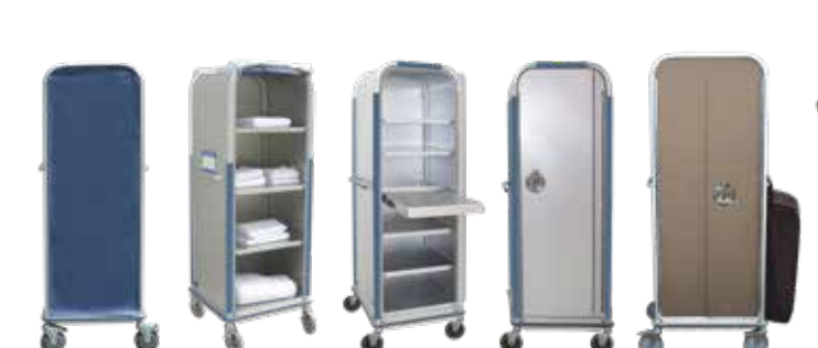
C-Cell Series | Tall and Narrow! Fits Anywhere.

Locking door Model Bi-Fold Locking Doors fold to side of carts Air-craft 3 Point Lock/ Digital locks available