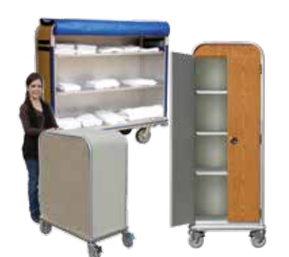
Transport Carts Linen & Supply Variety of Sizes & Customizable