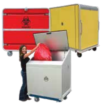
Collection Carts EVS • Dietary • Surgery Recycling • Hampers