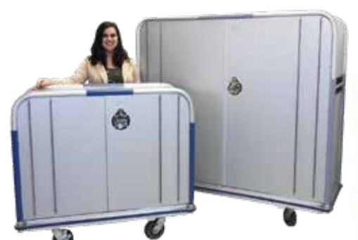
Color Code A Cart