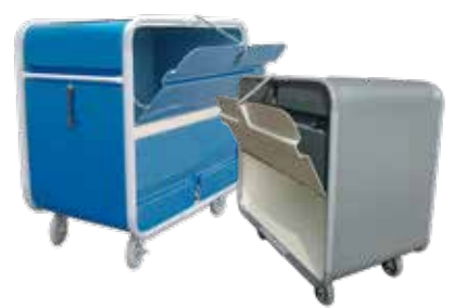
Quiet Ball Bearing Superior Wheels