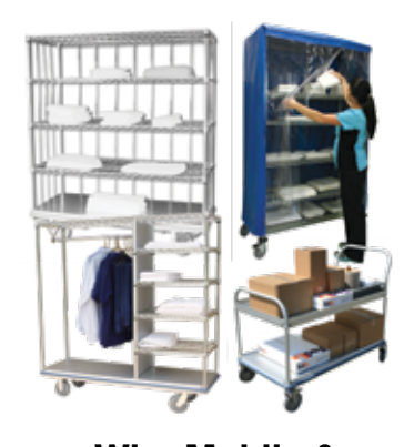
Wire Mobile & Storage Solutions SPD • Receiving • Linen COVERS for ALL Brands & Sizes of Carts