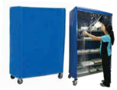
Drape Covers Choice of Colors Velcro or Zipper Closures

Solid Shelving - custom sizes available Shown with Optional: Enclosure Bars