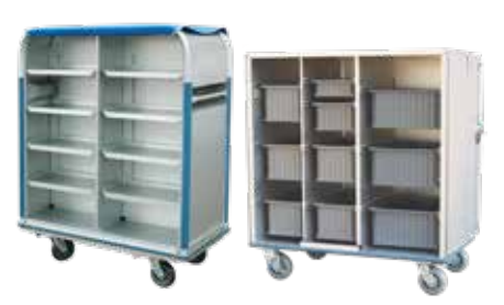
Design YOUR Own Interior

4 Interior Styles or create your own. Models Include Front Cover in Choice of Colors or Transparent