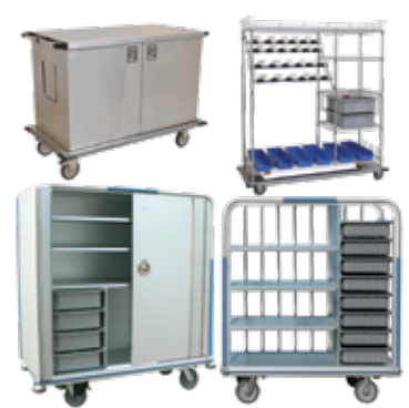
Case Carts • Med/Surg Central Supply Custom Cabinets & Applications