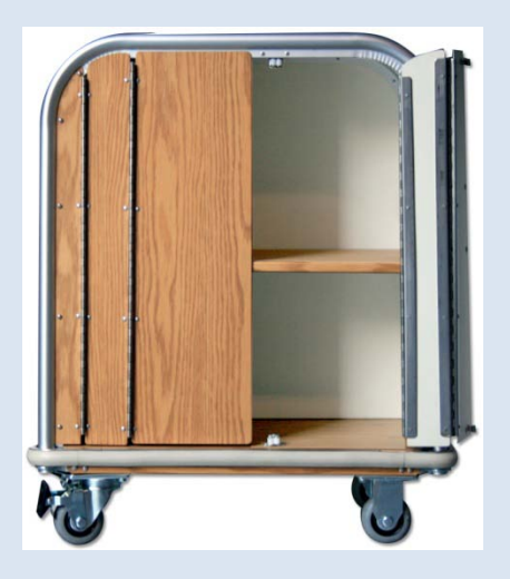
One of our L- 767 carts, custom sized, Light Oak Aluminum Exterior !