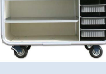
Shelving and Totes Carries Supplies Neatly