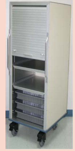
SPD-Models SUPPLY CART Tambour Door, shelving and tote drawers-Custom Size and interior and Vanilla Exterior

Emergency Response Carts – OSHA YELLOW – 2 custom interiors designed by our customer and Locking Doors!