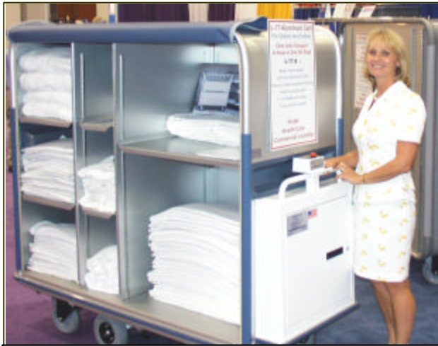
Seen above on aluminum Model L-77 24" x 60" x 70"

The Express Plus System can be easily installed on any model or size of TECNI-QUIP cart.