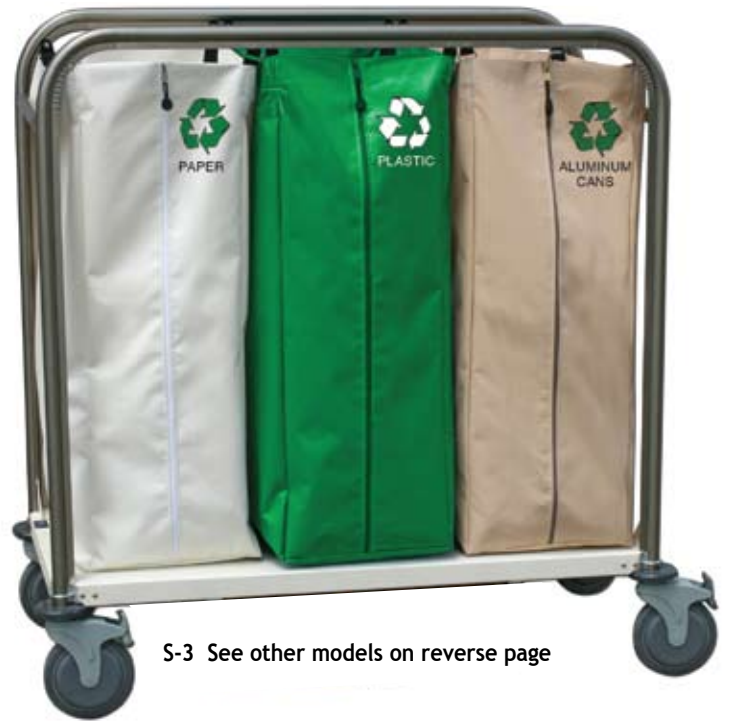
S-3 See other models on reverse page

Hospitals Long Term Care • Clinics Wellness Centers • Offices